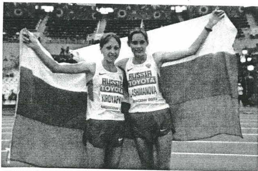
Elena Lashmanova celebrates her gold with compatriot and silver medallist Anisya Kirdyapkina after the 20km walk on Tuesday at the IAAF World Championships in Moscow.